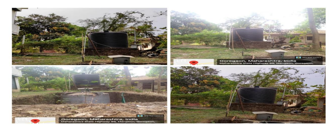
Underground Tank/Pits for Liquid Waste