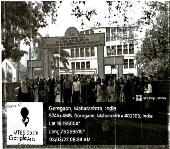
Departure from college for visit