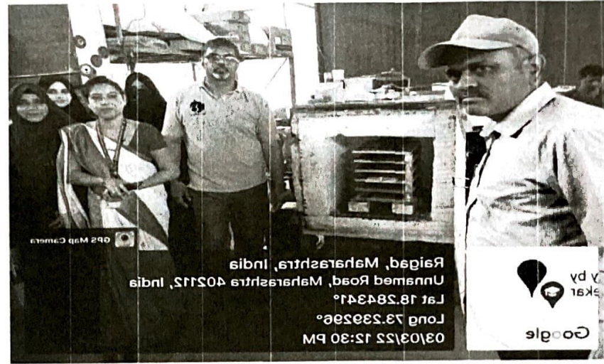
Visit at Anvi Pottery