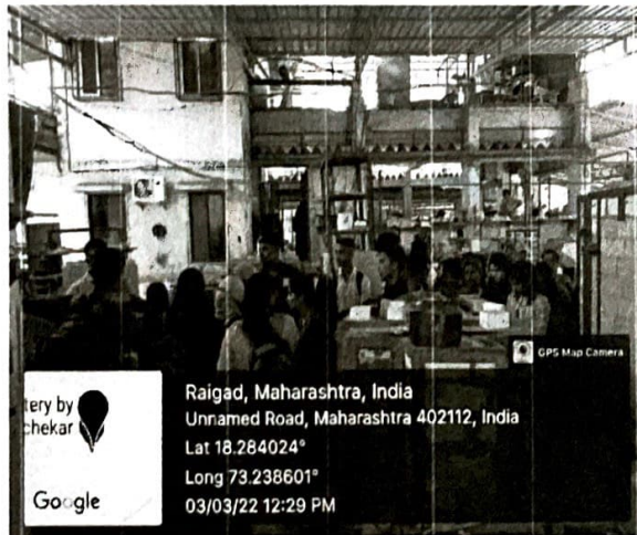
Visit at Anvi Pottery