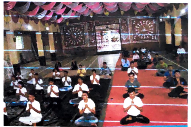
NCC cadets and Teachers performing Yoga demonstrated through Projector