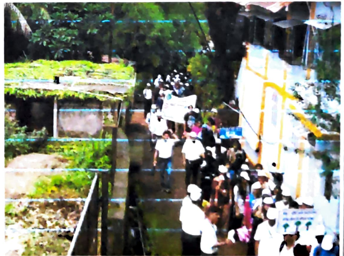
Plantation rally through Goregaon town creating buzz of importance of "Save Environment"

[Signature] CTO - NCC 2 MAH. ENGR. REGT NCC Mangaon Taluka Education Society's Doshi Vakil Arts College and G.C.U.B. Science & Commerce College Goregaon-Raigad (402 103)