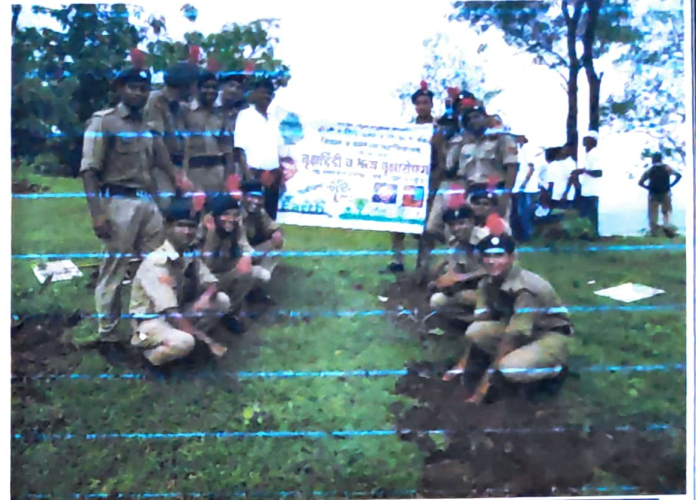
NCC cadets planted saplings at Mallikarjun Hill