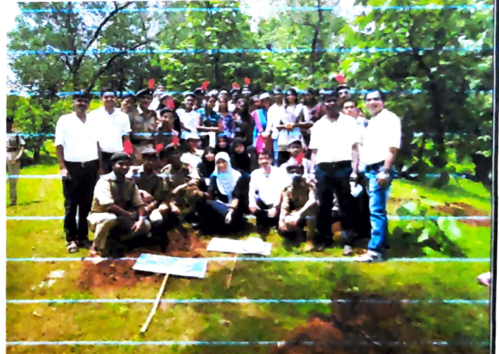
NCC cadets, students and staff during Plantation drive